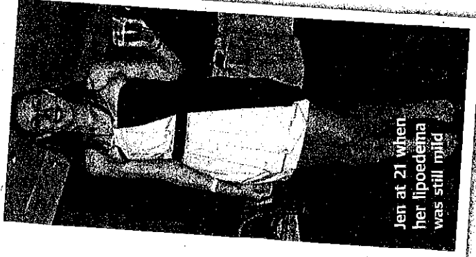
Jen at 21 when her lipoedema was still mild